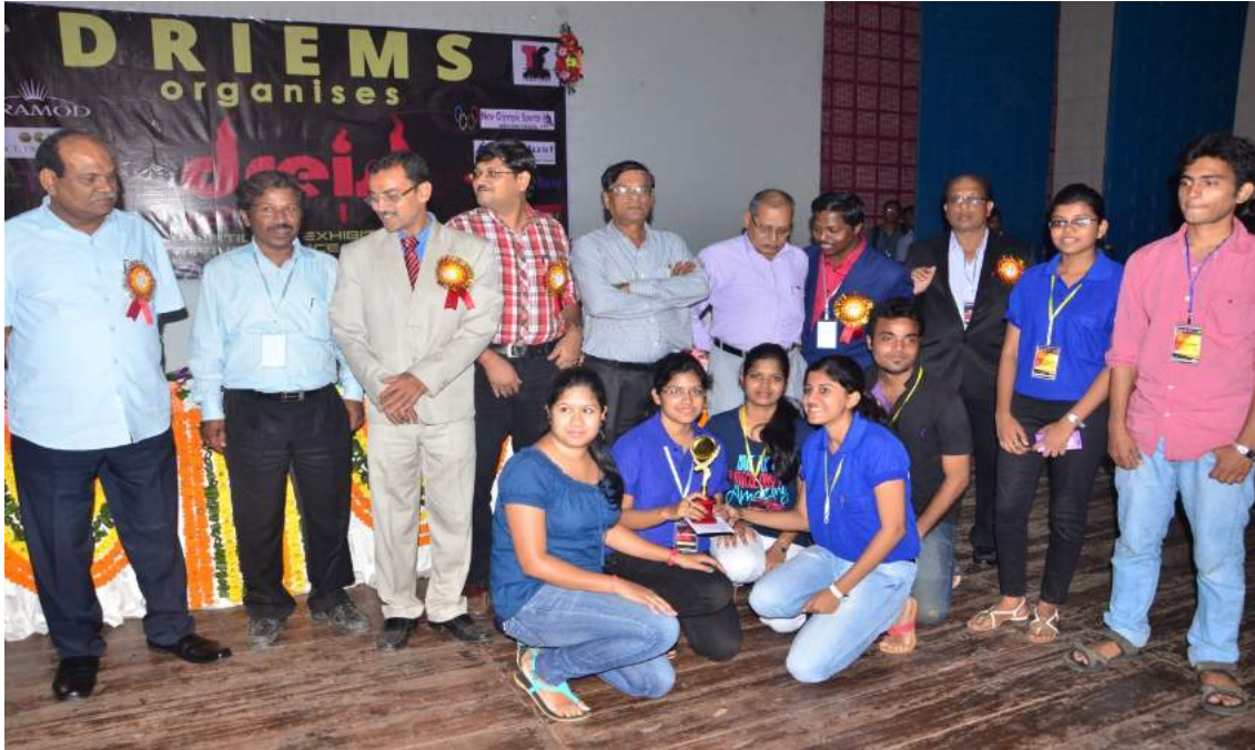
STUDENT PARTICIPANTS ARE AWARDED BY THE GUEST DURING DREIST-2K15 ON 08.11.2015