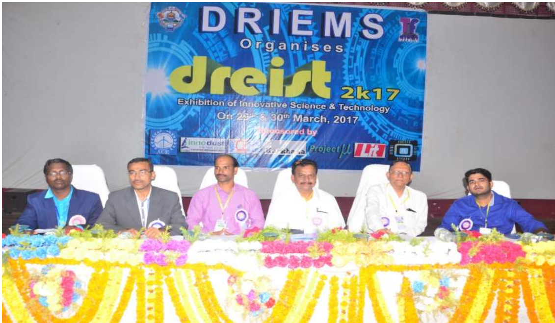
DIGNITARIES ON THE DIAS DURING THE VALEDICTORY DAY OF “DREIST-2K17” IN JAYASHREE AUDI ON 30.03.2017