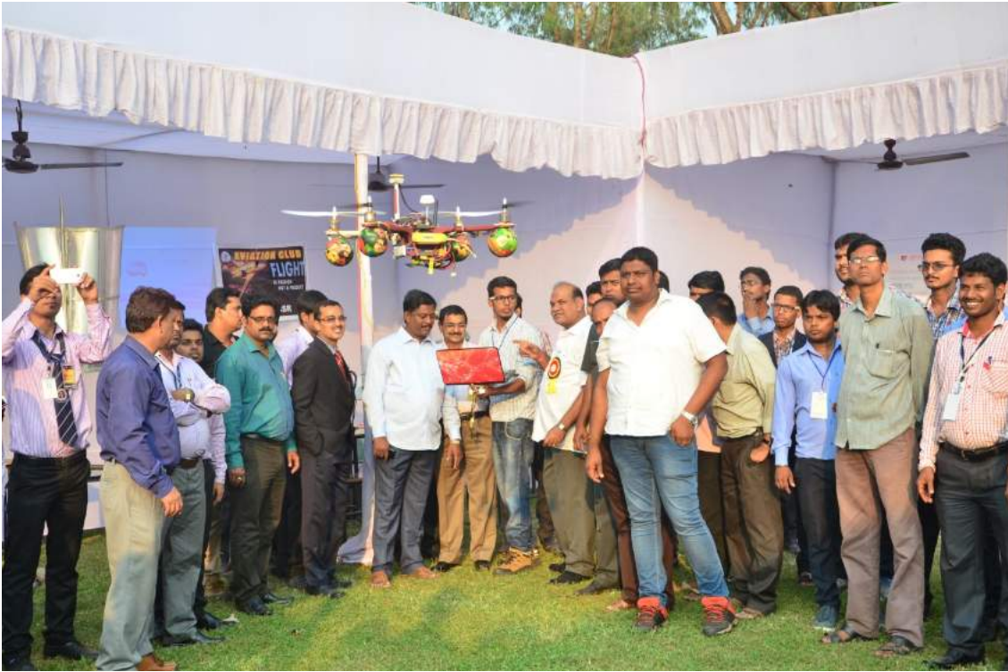
DRONE PROJECT OBSERVED BY THE GUEST DURING DREIST-2K15