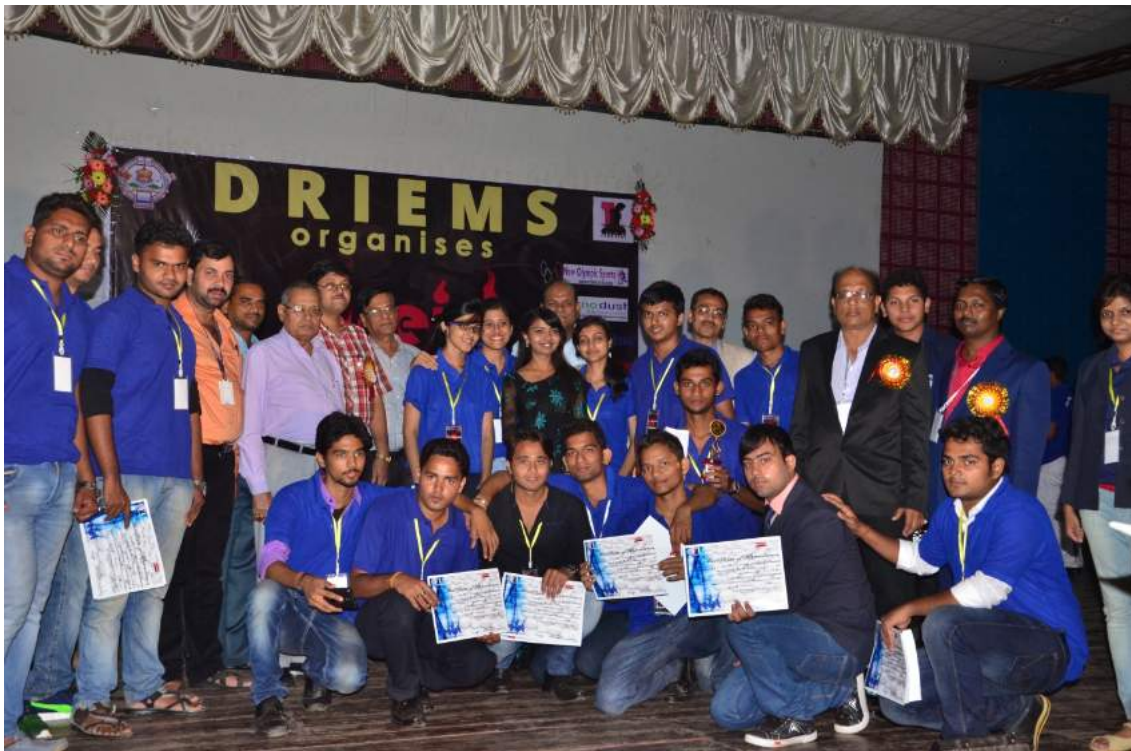
STUDENT COORDINATORS & FACUTY COORDINATORS OF DREIST-2K15 WITH THE DIGNITARIES ON 08.11.2015