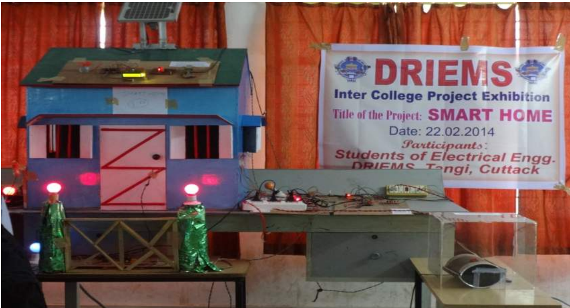
“SMART HOME” PROJECT WORK OF 4 TH YEAR ELECTRICAL ENGINEERING STUDENTS PARTICIPATING IN INTER COLLEGE TECH FEST HELD AT COEB , BBSR ON 22.02.2014