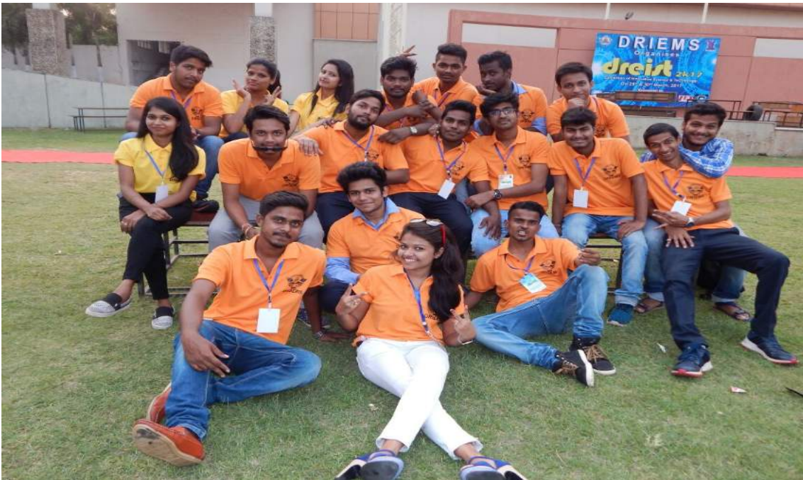
STUDENT COORDINATORS OF “DREIST-2K17”