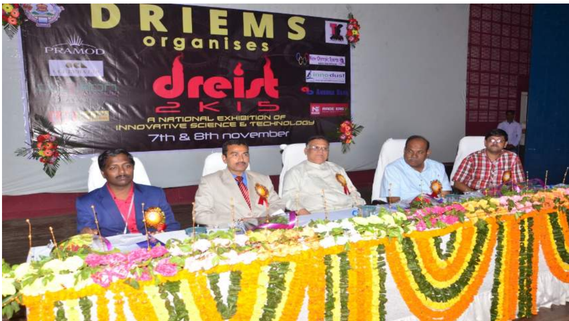
DIGNITARIES ON THE DIAS DURING DREIST-2K15 ON 08.11.2015