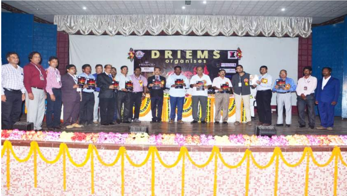
RELEASE OF SOUVENIR OF DREIST-2K15 BY THE DIGNITARIES IN JAYASHREE AUDITORIUM ON 07.11.2015