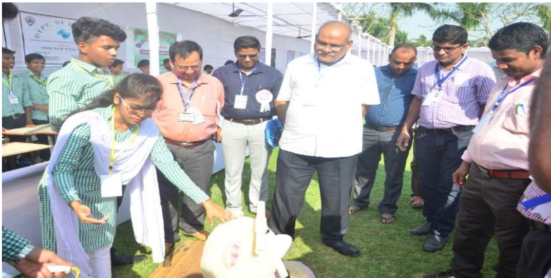
HON'BLE CHAIRMAN WITH THE DIGNITARIES INTERACTING WITH STUDENT PARTICIPANTS DURING DREIST-2K17 ON 29.03.2017