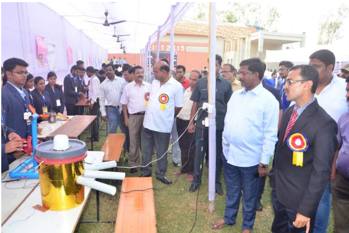
CHIEF GUEST ALONG WITH AUTHOR DIGNITARIES VISITING THE EXHIBITION STALL DURING DREIST2K15 ON 07.11.2015