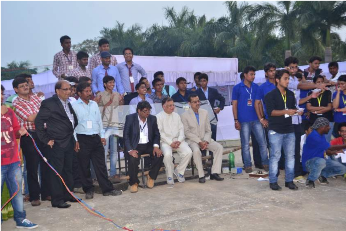
EXPERTS JUDGING THE THE ROBO FIGHTS DONE BY THE STUDENTS DURING DREIST-2K15 ON 08.11.2015