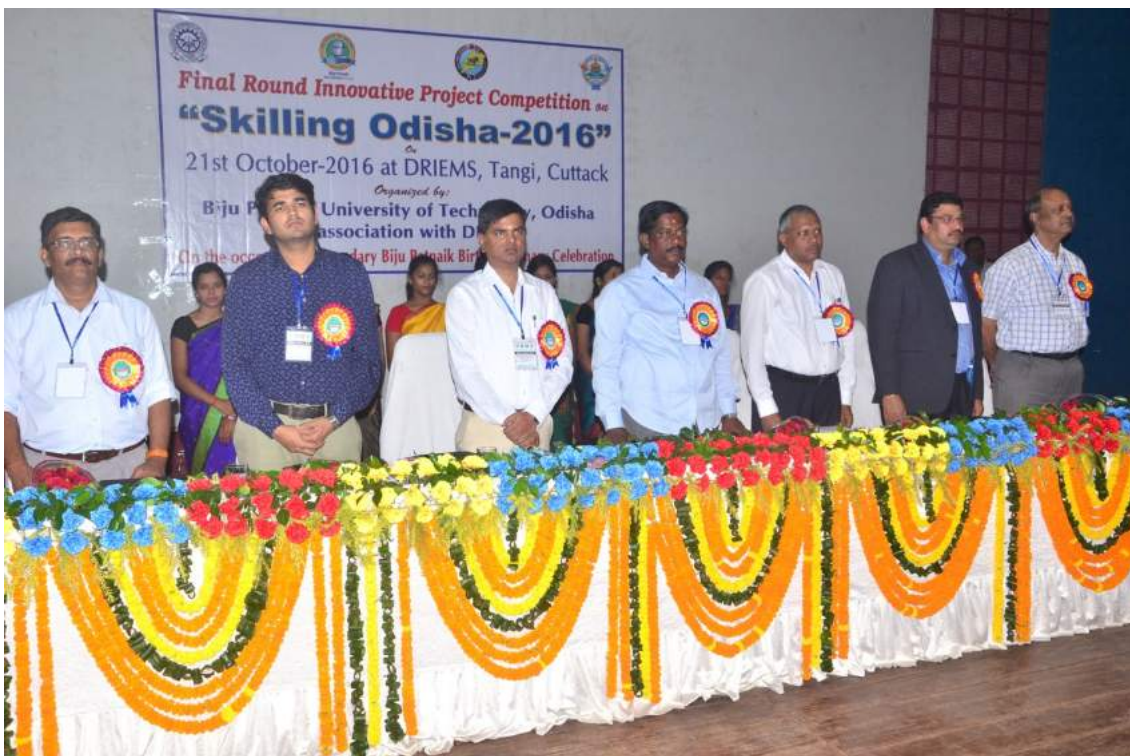
DIGNITARIES ON THE DIAS DURING SKILLING ODISHA-2016 ORGANISED BY DRIEMS , CUTTACK, INDIA ON 21.10.2016