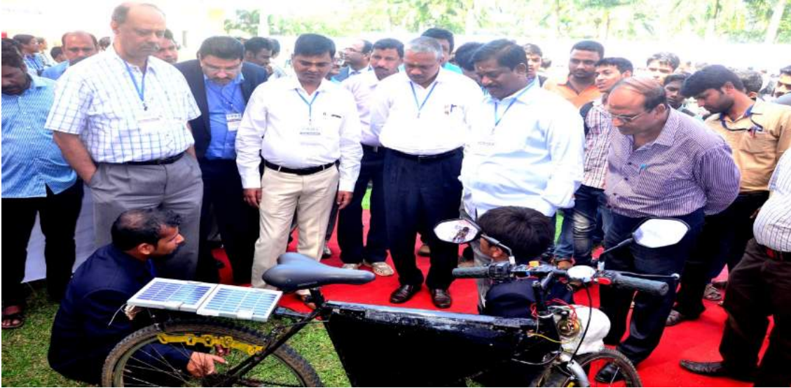
DIGNITARIES VIEWING THE SELECTED PROJECT WORKS DURING THE SKILLING ODISHA-2016 ORGANISED BY DRIEMS , CUTTACK IN OPEN AIR AUDITORIUM