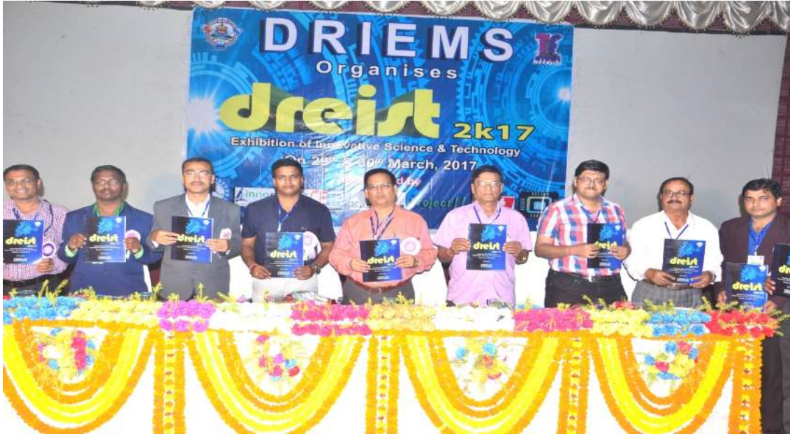
SOUVENIR OF DREIST2K17(EXHIBITION OF INNOVATIVE SCIENCE & TECHNOLOGY) RELEASED BY DIGNITARIES ON THE DIAS IN JAYASHREE AUDI